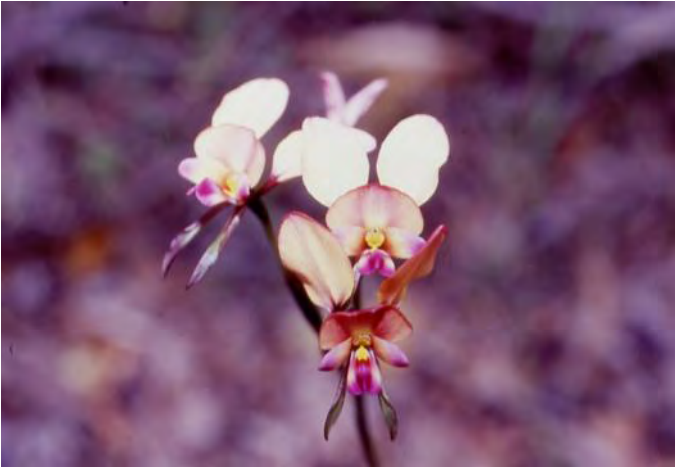
Above : Diuris amplissima, the Giant Donkey Orchid, flowering from late September through to November.