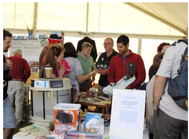
Below: A busy marquee.