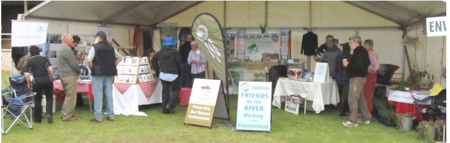
Above: A very busy Environment Matters marquee.