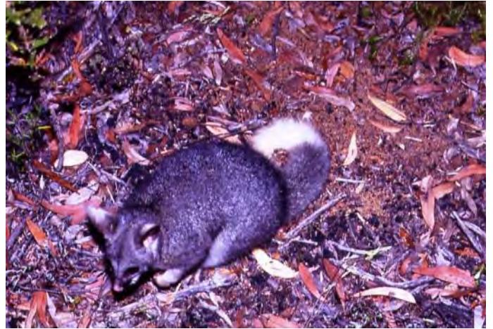
Above: Brush-tailed possum, with a good section of white tail.