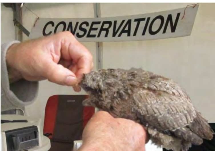
Below: One of the exhibits gets a feed. A very young Tawny Frogmouth.