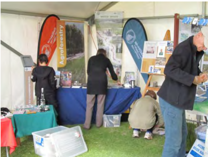
Above: Setting up the Environment Matters marquee for the 2013 Agricultural Show