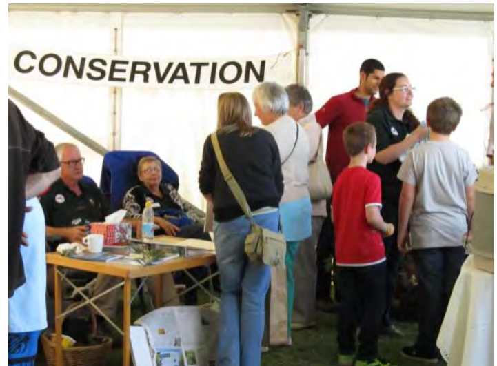
Above: As usual, the Wildlife Carers are busy giving out information, and showing off the animals they care for.